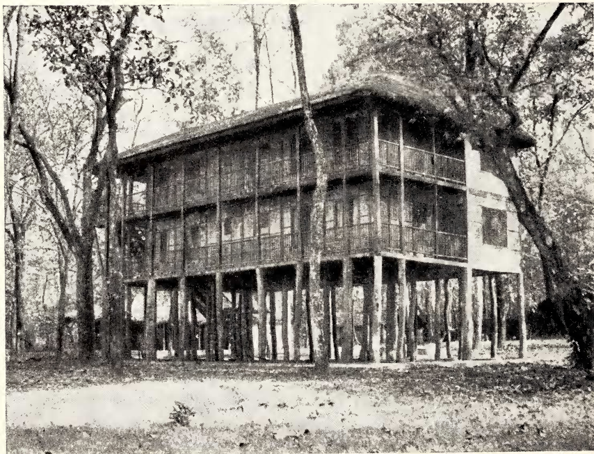
Above : Mother and large young rhino

These domestic buffaloes should be removed from the proposed national park where they are grazing.